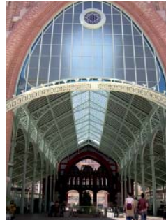
This enchanting city offers a most splendid site to any person seeking the culture and personality of Spain.