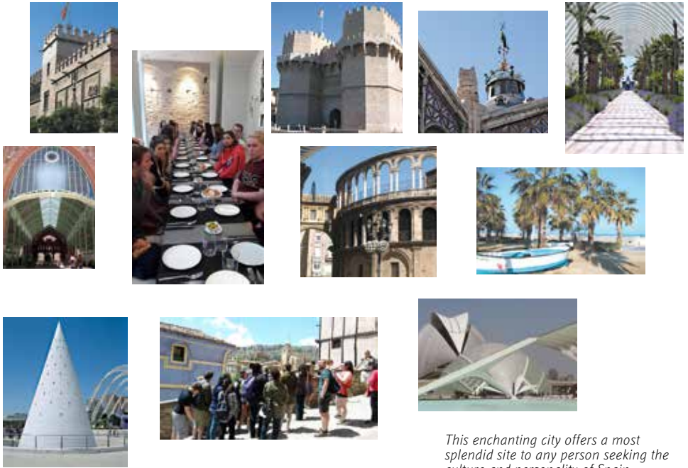
This enchanting city offers a most splendid site to any person seeking the culture and personality of Spain.